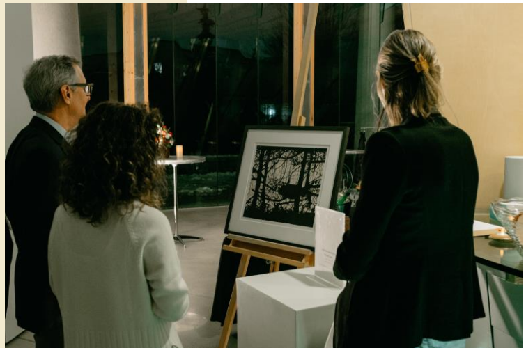
Above: Successful bidders of the Fall Fête Silent Auction admiring their newly acquired Gordon Smith print.

The Smith Foundation received $124,737.35 in annual interest from our Vancouver Foundation-held endowment fund. These monies, coupled with annual fundraising efforts, allowed us to grant $85,000 to Artists for Kids and $7,500 in scholarships to graduating secondary students in North Vancouver, West Vancouver and Vancouver.